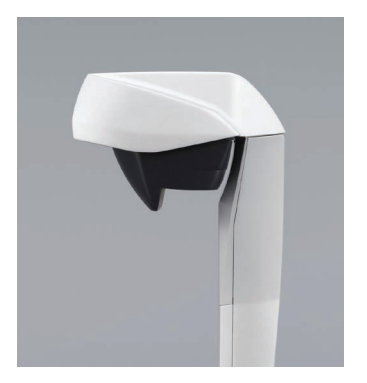
The SV600 scans documents with a movable head and incorporates a highly directional LED lamp Helps maintain the same brightness

level without any interference from surroundings